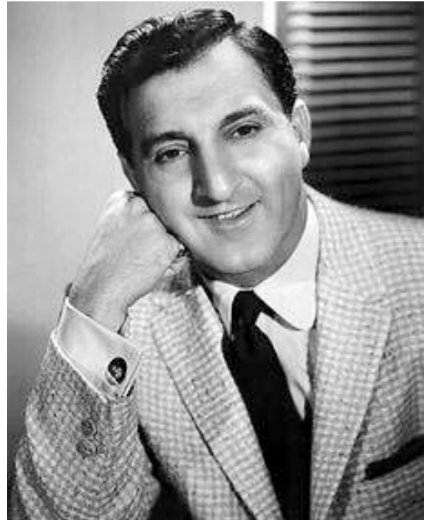
Dany Thomas Jan. 6, 1912 – Feb. 6, 1991

Since its inception, St. Jude has treated children from all 50 states and around the world, continuing the mission of finding cures and saving children.