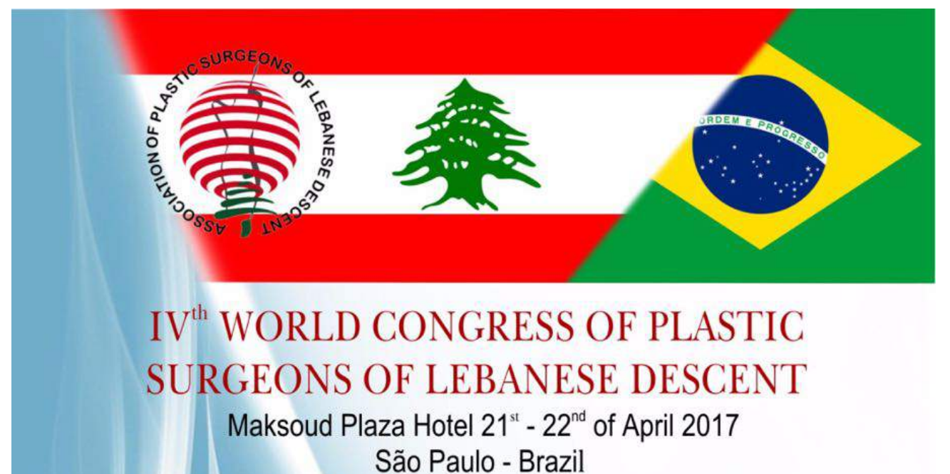
Photo Gallery of all APSLD congresses can be viewed at the following link: <u>https://onedrive.live.com/redir?resid=28541A1CEA8DBB24!</u> <u>104&authkey=!AGGCgt2KDX3XZes&ithint=folder%2c</u>